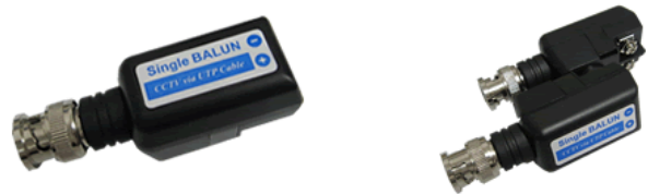
Single Channel Passive CAT5 Video Transceiver